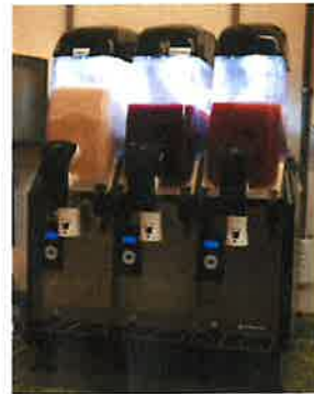
Works Great in Slushie Machines