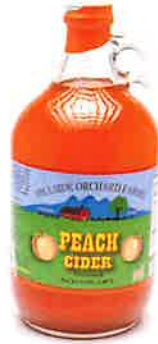
64 oz Cider