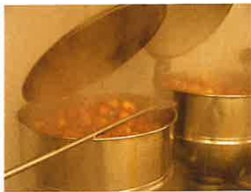
Cooking Down Apples for Old Fashion Apple Butter

Marmalade: whole citrus (either chopped or left intact) + sugar